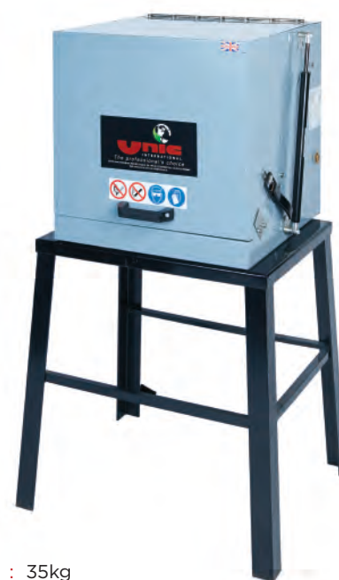
Picture shows optional table