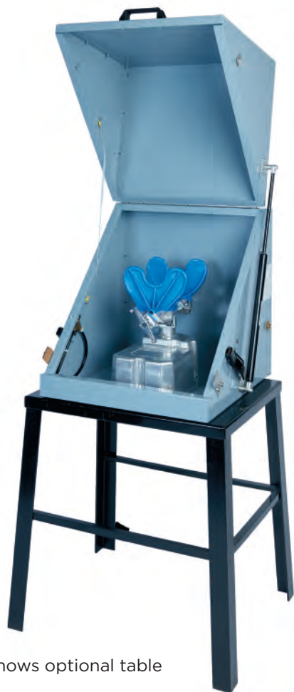
Picture shows optional table